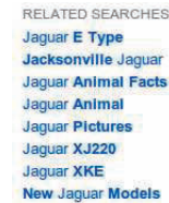
Figure 2: Related queries for the query ‘jaguar’