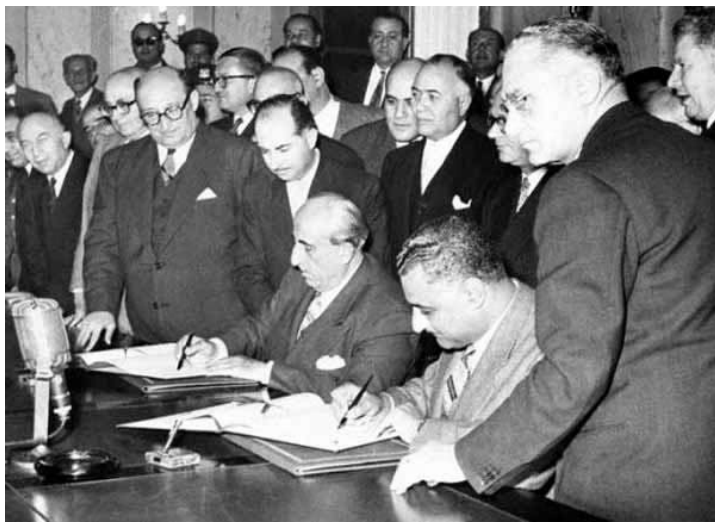
Nasser signing unity pact with Syrian president Shukri al-Quwatli, forming the United Arab Republic, February 1958

crackdown against the Syrian Communists and opponents of the union which included dismissing Bizri and Azem from their posts. [3] [6]