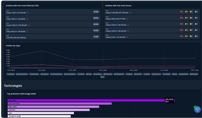
FIGURE 3. Analyze and communicate trends and insights from around the external ecosystem.