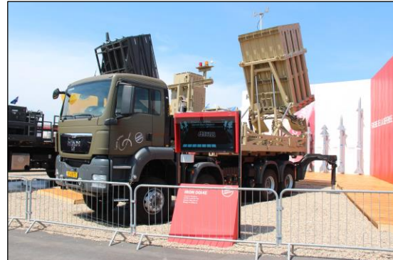
Figure 8. Iron Dome Launcher

In March 2014, the U.S. and Israeli governments signed a co-production agreement to enable the manufacture of components of the Iron Dome system in the United States, while also providing the U.S. Missile Defense Agency (MDA) with full access to what had been proprietary Iron Dome technology. 95 U.S.-based Raytheon is Rafael's U.S. partner in the co-production of Iron Dome. 96 In 2020, the two companies formed a joint venture incorporated in the United States known as "Raytheon Rafael Area Protection Systems (R2S)." Tamir interceptors (the U.S. version is called SkyHunter) are manufactured at Raytheon's missiles and defense facility in Tucson, Arizona and elsewhere and then assembled in Israel. Israel also maintains the ability to manufacture Tamir interceptors within Israel.