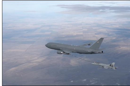
Figure 6. The KC-46A Pegasus