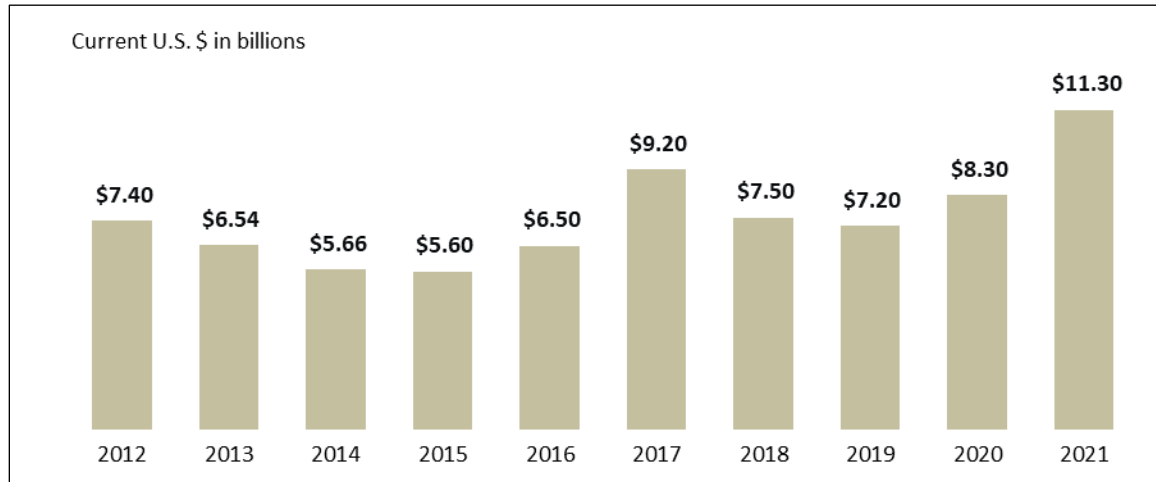
Figure 1. Israel's Annual Arms Exports: 2012-2021

Source: Created by CRS. Information from Israel Ministry of Defense, International Defense Cooperation Directorate (SIBAT), as reported by various media sources.