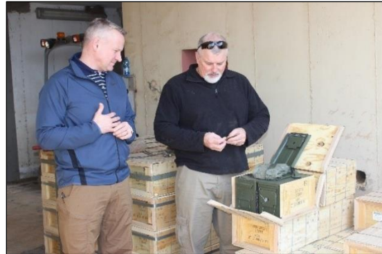
Figure 10. Army Officers Inspect WRSA-I