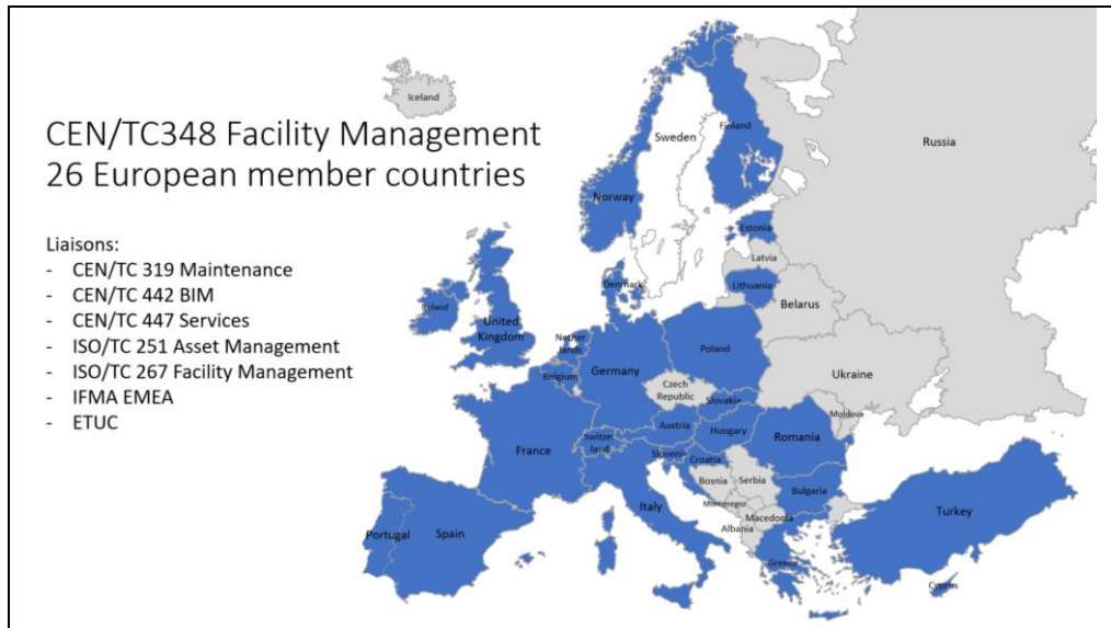
Figure 2 – Overview of CEN/TC 348 members and liaisons

There are 26 national member bodies of CEN represented in CEN/TC 348 in additions to our liaisons and observers given in 4.3, see Figure 2: