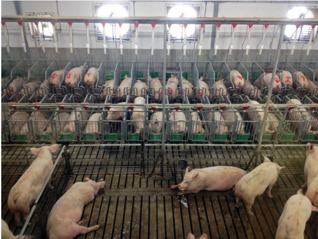
FIGURE 5: While Fair Oaks uses group housing for its sows, females in the last stage of pregnancy are confined to individual gestation crates, albeit in the same space. While some producers are moving away from gestation crates, their use remains the predominant mode of sow housing.