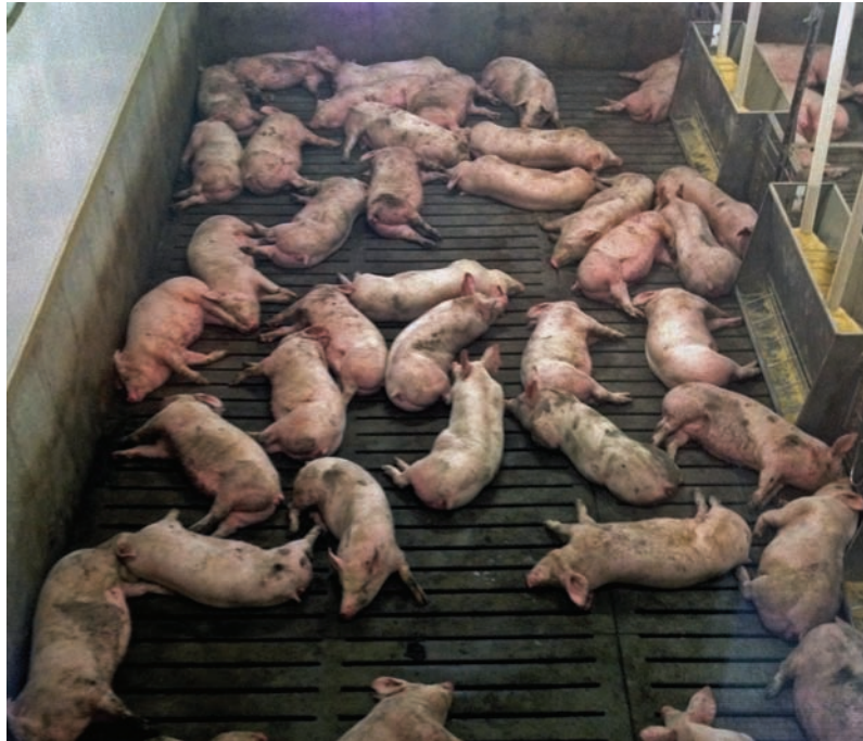
FIGURE 3: Growing piglets are housed in group pens, into which visitors look down from raised, glass-walled catwalks.