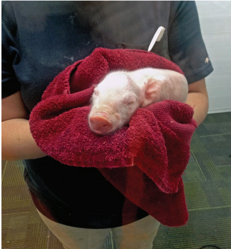
FIGURE 4: The tour of the glass-walled breeding farm culminates in a photo opportunity (through a pane of glass) with a newborn piglet, seen here swathed in a towel and cradled in the arms of a Fair Oaks employee.