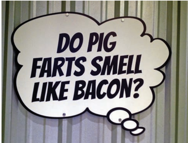
FIGURE 2: In the Pork Building, pig-related jokes are interspersed with media representations of pigs and hog- and farming-related scientific and economic factoids.