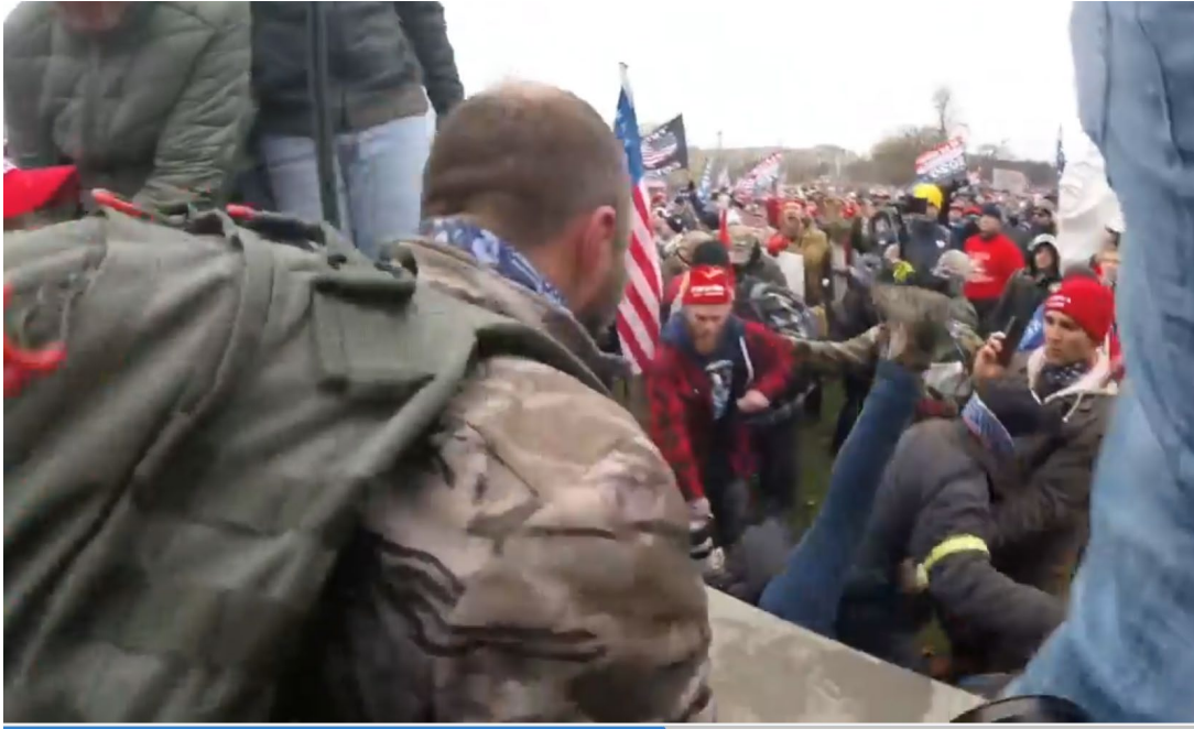
Screenshot 11: Source – The Video

25. Based on the timing and location of the above-described assault, your affiant reviewed the body-worn camera footage (the “BWC Video”) of a District of Columbia Metropolitan Police Department (“MPD”) Officer who was standing near the Lower West Terrace of the U.S. Capitol during the approximate time that the assault occurred. The officer was positioned near a line of bike racks, which was being used as a barrier against the assembling crowd by officers of the MPD and U.S. Capitol Police. The bike rack was positioned close to the top lip of the stairs that the MONM victim was observed to be standing on at the beginning of The Video. At approximately 1:31 PM, the MONM victim can be observed on the BWC Video facing the line of officers and taking pictures of them (BWC Video – Screenshot 12). The MONM victim is observed to be wearing clothing consistent with The Video.