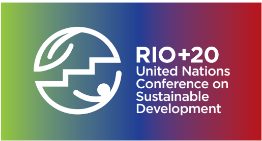
White over gradient background