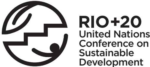
Black and White