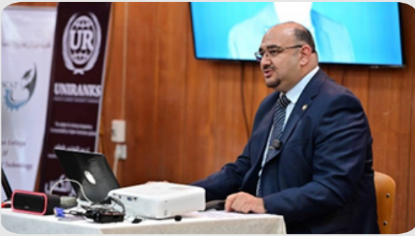
TVE institutes ranking workshop Ministry of Technical and Vocational Education (MoTVE) Surman, Libya

The Ministry of Technical and Vocational Education organized a workshop on 4 September 2023 on classifying Libyan technical and vocational education institutions. The workshop focused on systematizing the evaluation of technical and vocational education institutions according to international standards to map the progress achieved in the quality of services provided and compare them with each other and with higher education institutions in Libya, the Arab region, and the world as a whole. All technical colleges and technical higher institutes will go through a ranking system with UNIRANKS to modernize Libyan educational institutions.