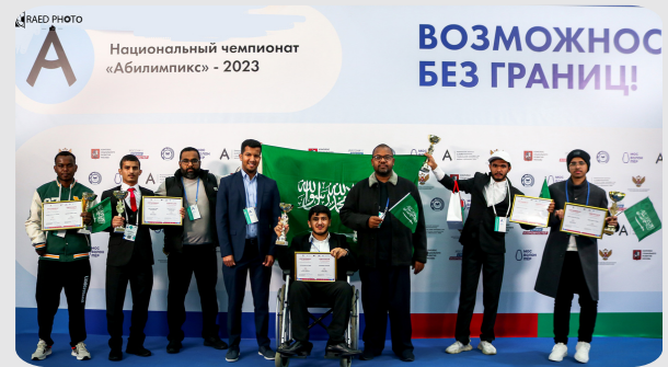
Vocational Excellence Championship for People with Disabilities (Abilympics 2023) Technical and Vocational Training Cooperation (TVTC), Saudi Arabia Moscow, Russia Federation

TVTC's trainees from various training facilities across Saudi Arabia participated in the Vocational Excellence Championship for People with Disabilities, which was held in the city of Moscow (Abilympics 2023), from 20 October to 22 October 2023. The trainees achieved success and distinction in the 'Passing the Skill within the Allotted Time' competition in the specializations of electricity, technical support and network management.