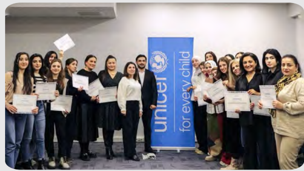
Training on children's safety and security Azerbaijan Public Employment Agency (APEA) Baku, Azerbaijan

On 17 December 2023, APEA and UNICEF conducted a training session on child protection and rights. The training sessions also emphasized the significance of reporting any case of violence against children to the relevant authorities.