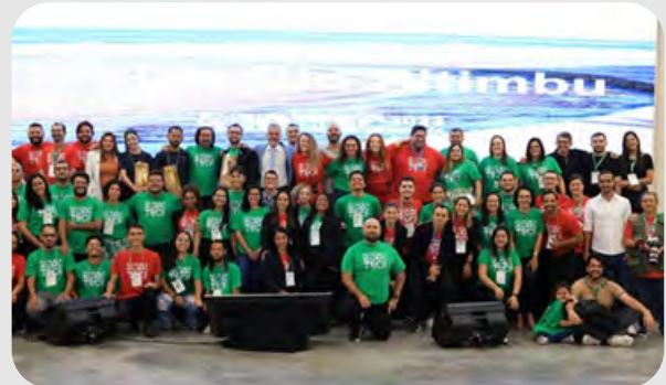
47th meeting of the leaders of professional and technological education institutions (REDITEC) National Council for the Federal Network of Vocational, Scientific and Technological Education Institutions (CONIF)