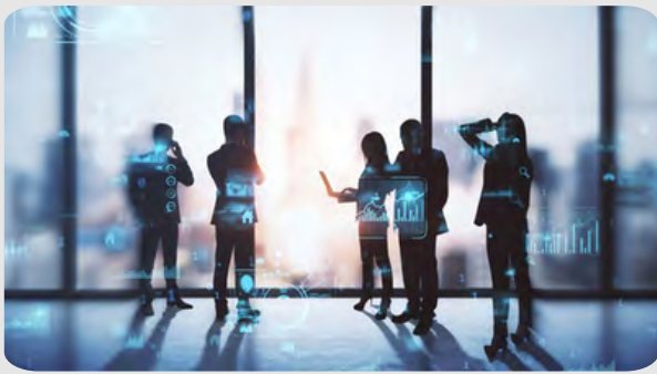
International conference in Bonn Federal Institute for Vocational Education and Training (BIBB) Bonn, Germany

The Federal Institute for Vocational Education and Training (BIBB) in Germany organized an international conference on 'Vocational Education, Skilled Workers and Transformation in an International Perspective' from 30 November to 1 December 2023. The conference discussed contributions of skilled work to occupational task change and innovation. It provided an opportunity for researchers and professionals to discuss and exchange their insights and studies in technological and ecological innovation.