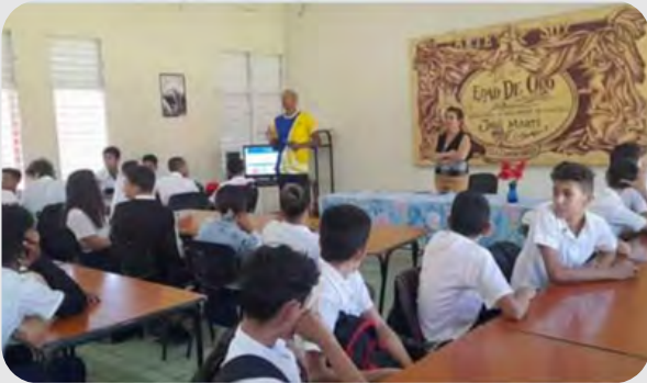
Annual campaign of 16 days of activism against gender-based violence of the ETP PROFET Project Ministry of Education / Directorate of Technical and Vocational Education (MINED)