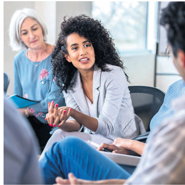
Recovery colleges run workshops in maintaining good mental health