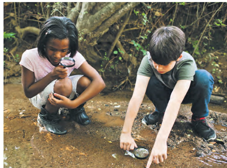
▲ Outdoor lessons are being rolled out through the Nature Friendly Schools programme.

I am hoping to combine my two roles in the future, as there is talk about co-producing a three-day horticultural course in partnership with Core Landscapes.