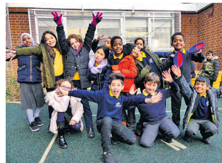
▲ Queen's Park primary has been praised for its approach to mental health

► Mental health first aiders are trained to support children through the emotional ups and downs of the school day