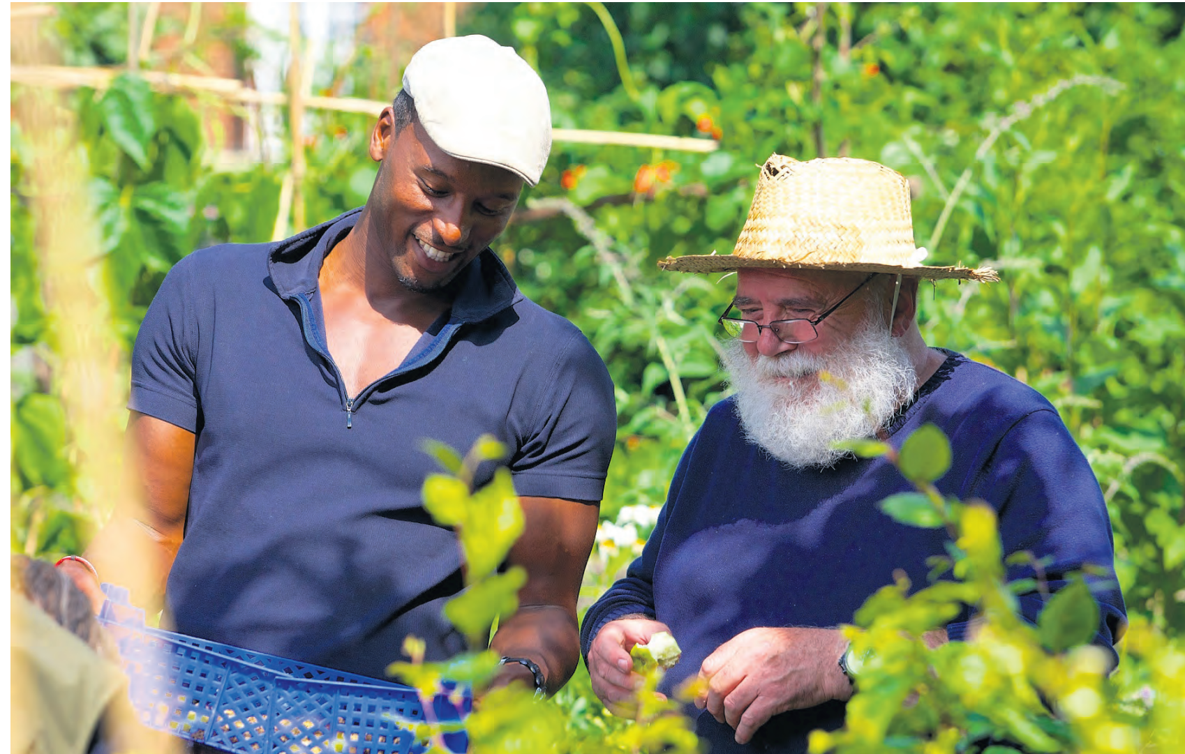
▼ GPs are keen to promote 'green therapy' on the NHS to boost wellbeing