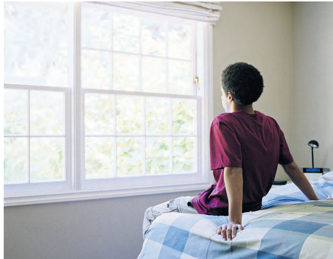
It is estimated that just one death from suicide can affect up to 60 people

In the UK, Samaritans can be contacted on 116 123 or email jo@samaritans.org