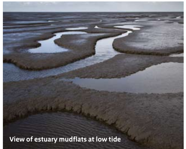
View of estuary mudflats at low tide

Of course, wherever you find large flocks of birds, you also find aerial hunters. Peregrines, merlins and harriers are all frequent visitors to the Wash, while short-eared and barn owls use the sea wall and saltmarsh as hunting and roosting areas.