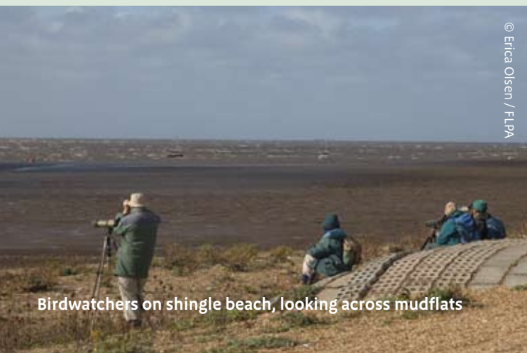
Birdwatchers on shingle beach, looking across mudflats

Under the waves, the Wash plays an important role as a nursery for fish, notably plaice, sole, cod and whiting.