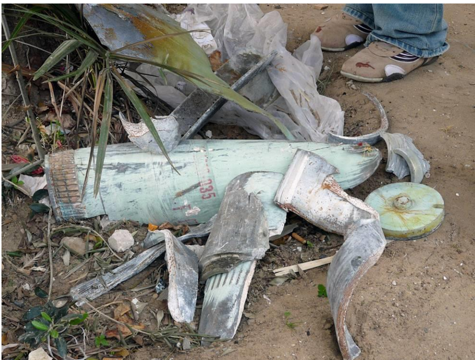
A white phosphorus carrier shell © Amnesty International

Amnesty International found that the Israeli army used white phosphorus, a weapon with a highly incendiary effect, in densely-populated civilian residential areas in and around Gaza City, and in the north and south of the Gaza Strip. The organization's delegates found white phosphorus still burning in residential areas throughout Gaza days after the ceasefire came into effect on 18 January - that is, up to three weeks after the white phosphorus artillery shells had been fired by Israeli forces. Amnesty International considers that the repeated use of white phosphorus in this way in densely-populated civilian areas constitutes a form of indiscriminate attack, and amounts to a war crime. 3