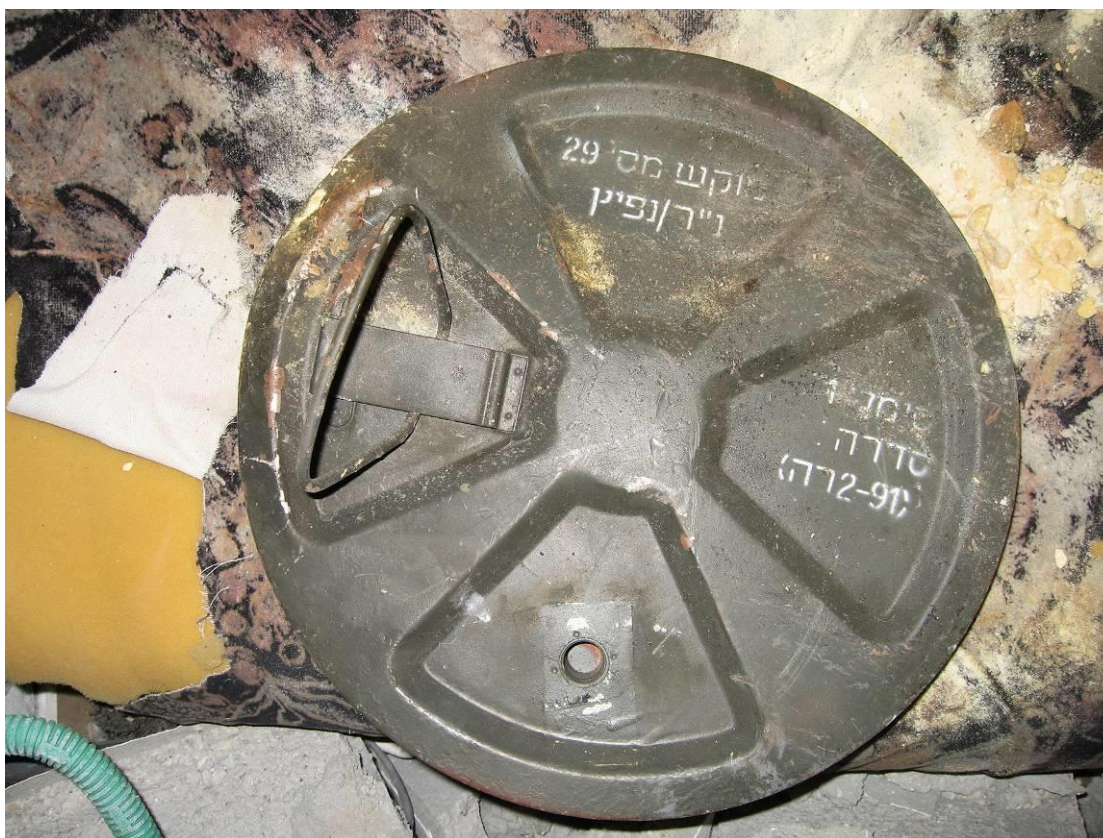
An Israeli anti-tank mine with Hebrew markings

On Wednesday 28 January, at the home of the Mardi family in Atatra, where 20 members of the family lived, Amnesty International delegates found one of the anti-tank mines that was used by Israeli soldiers to blow up the family's house on 4 January. The mine was damaged but had failed to explode. The family said that they had found another such mine, wholly unexploded, which had been removed by the local police. The mine, like others - exploded and unexploded - found by AI delegates in the rubble of other destroyed houses, bore Hebrew writing and serial numbers. Though designed for use against tanks, these mines are easily adapted to other purposes through the addition of an explosive charge and fuse. Israeli soldiers have previously confirmed to Amnesty International that these anti-tank mines have long been used to destroy Palestinian houses, most often in the West Bank but also in Gaza.