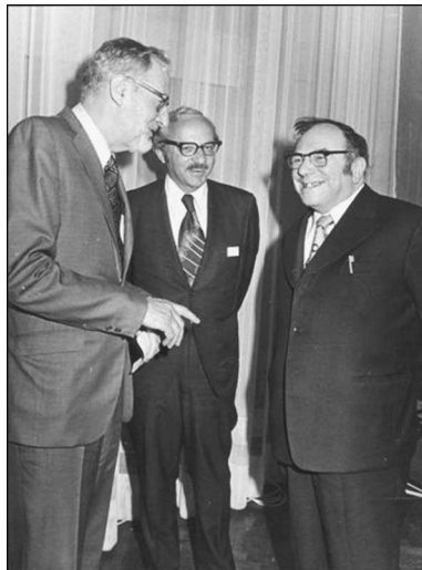
Left to right: T. C. Koopmans, G. B. Dantzig, L. V. Kantorovitch, 1975

Dantzig’s leadership and the addition of other faculty and staff contributed greatly to the international stature of the Stanford OR Department. Among Dantzig’s many ventures during this period, the Systems Optimization Laboratory (SOL) stands out as one of the most influential and enduring. At the 1971 Elsinore Conference mentioned above, Dantzig discoursed “On the Need for a Systems Optimization Laboratory”. A year later, he (and a host of co-authors) put forward another version of this concept at an Advanced Seminar on Mathematical Programming at Madison, Wisconsin. As Dantzig put it, the purpose of an SOL was to develop “computational methods and associated computer routines for numerical analysis and optimization of large-scale systems”. By 1973 Stanford