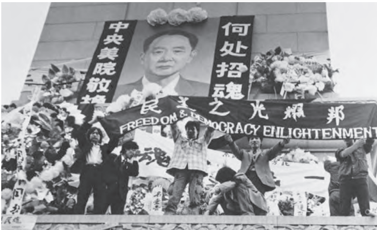
Tiananmen Square protesters waving a banner reading "Freedom and Democracy Enlightenment" under a funeral portrait of Hua Yaobang.

an excellent opportunity to draw China closer to Japan and the West, and thus help reduce potential future conflict.