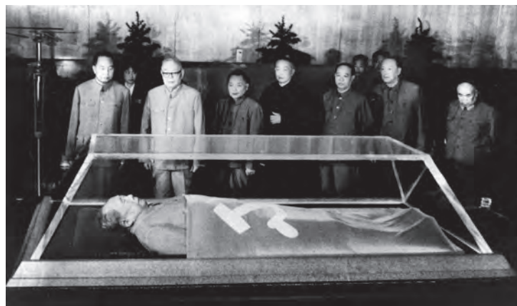
September 21, 1977. The funeral of Mao Zedong, Beijing, China.

T he 9th of September 1976: The story of Deng Xiaoping's ascendancy to paramount leader starts, like many great stories, with a death. Nothing quite so dramatic as a murder or an assassination, just the quiet and unassuming death of Mao Zedong, the founding father of the People's Republic of China (PRC). In the wake of his passing, factions in the Chinese Communist Party (CCP) competed to establish who would rule after the Great Helmsman. Power, after all, abhors a vacuum. In the first corner was Hua Guofeng, an unassuming functionary who had skyrocketed to power under the late chairman's patronage. In the second corner, the Gang of Four, consisting of Mao's widow, Jiang Qing, and her entourage of radical, leftist, Shanghai-based CCP officials.