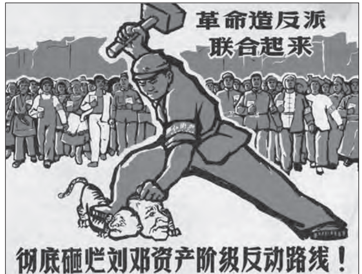
Ca. 1967 Chinese poster with the statement “Completely smash the capitalist class and the reactionary line of Liu and Deng!”

Deng and Liu Shaoqi were accused of being “revisionists,” “rightists,” and “capitalist-roaders,” which eventually led to both men being purged in 1967.