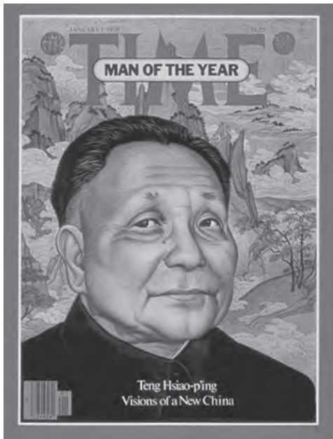
Deng Xiaoping on the “Man of the Year,” January 1st, 1979, Time magazine cover.

and political liberalization as intertwined, Deng refused to undermine the CCP’s control of the state. And perhaps the course of history has proven him right. While the Eastern Bloc and the Soviet Union collapsed from 1989 to 1991, the CCP remained firmly in charge, then and now.