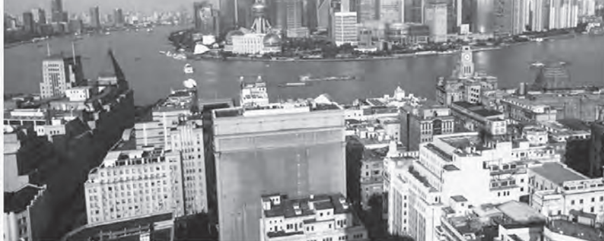
Shanghai was one of the fourteen selected SEZ coastal cities in 1984.

successes possible under the SEZ model, while Zhuhai never recorded the same levels of spectacular growth. Nevertheless, the success of Shenzhen set the tone for accelerating economic development and resulted in the expansion of the program to huge swathes of China. In short order, fourteen more coastal cities were designated SEZs in 1984; three “development triangles” in the Pearl, Min, and Yangtze river deltas in 1985; the entirety of Hainan Island in 1986; and six ports on the Yangtze River and eleven border cities in 1992. Similarly, in 1990, Shanghai and ten other cities on the Yangtze River were designated “open cities” that allowed direct overseas investment. To begin with, the Chinese government encouraged the investment of capital and technical skills from the overseas Chinese. 12 As such, much of the first wave of foreign investment in China came from Hong Kong and Taiwan, with a second significant wave from Southeast Asia, particularly Singapore. Following the normalization of China’s relations with the US and Japan, China also saw incremental increases in investment from both countries, as well as Europe and the rest of the developed world, though they were still dwarfed by overseas Chinese investment for much of the twentieth century.