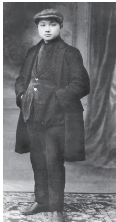
Deng Xiaoping at the age of sixteen in France.

In 1934, following the GMD's encirclement of the CCP, Deng was forced to undertake the Long March (October 16, 1934–October 22, 1935) from Jiangxi with most of the Red Army as they sought to escape the pursuits of the GMD and its allies. His involvement in the Long March cemented his reputation due to the strong relationship he developed with Mao, as well as the personal prestige that emerged as a result of the mythmaking that went into the Long March. 5 Following the outbreak of the Second Sino-Japanese War and the declaration of the Second United Front between the GMD and CCP, Deng was promoted as a full member to the central committee and reassigned to serve as political commissar under Commander Liu Bocheng (nicknamed the “One-Eyed Dragon”). The Liu–Deng Army scored many victories against the Japanese and, following the end of World War II and resumption of the Civil War, continued their military success against the GMD. By the end of the war and the founding of the People's Republic of China, Liu and Deng were promoted to chairman and vice chairman of the southwestern regions of China.