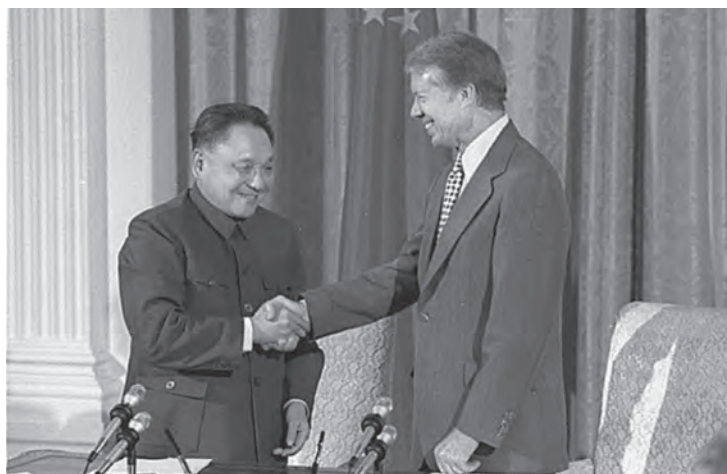
On January 31, 1979, Vice Premier Deng Xiaoping and President Jimmy Carter signed diplomatic agreements between the United States and China.

In addition to the US, Deng also presided over the improvement of Sino–Japanese relations. Japan and China had negotiated a limited level of Japanese investment into the Chinese economy after the establishment of diplomatic relations in 1972, but this increased substantially following Deng’s elevation to paramount leader. Deng recognized that to ensure his reforms could succeed, he needed financial and technical support from Japan. Conversely, Japanese Prime Minister Takeo Fukuda saw deepening relations with China as