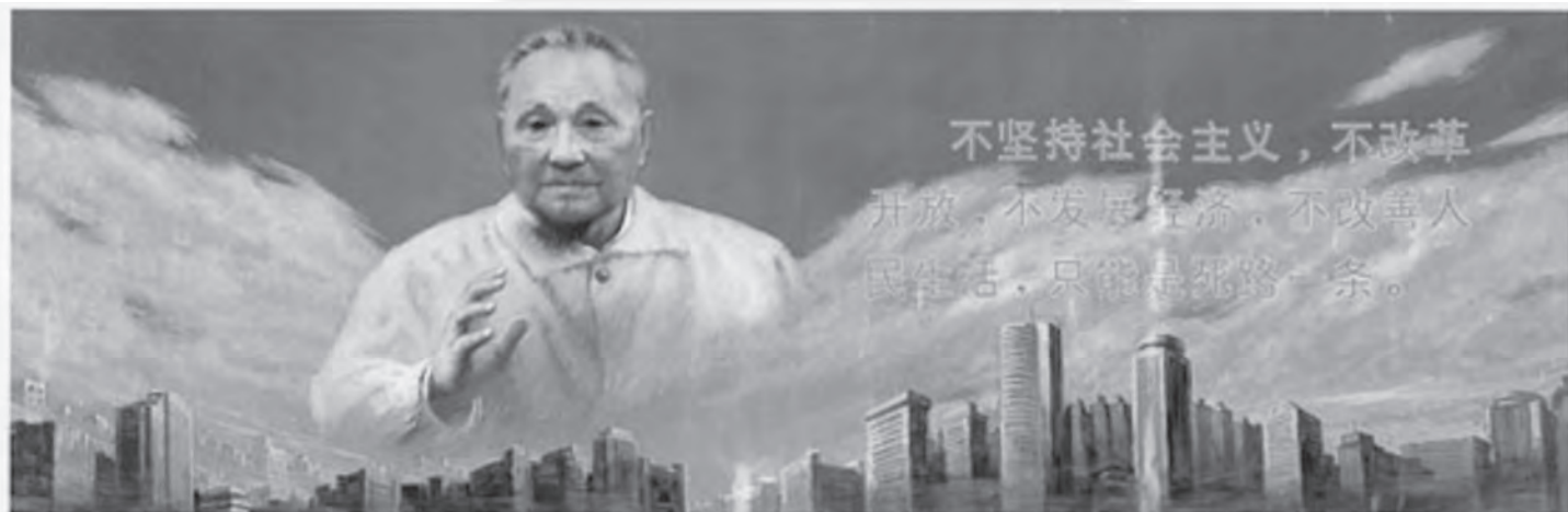
COMRADE DENG XIAO-PING IN HIS SOUTH INVESTIGATION TOUR TO SHENZHEN