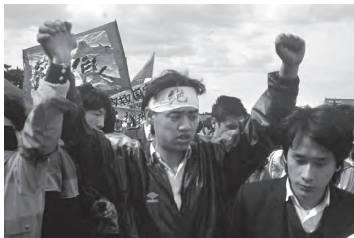
May 13, 1989, student protest leader Wuer Kaixi protested among a crowd of students during a demonstration on Tiananmen Square in Beijing, China. Kaixi wore a headband that reads Jueshi (“hunger strike”).

On June 2, Deng agreed with the hardliners, who had pushed for the square to be cleared to restore order to the capital. The PLA moved in, opening fire on protestors and any civilians that blocked their way, eventually surrounding it. The protestors negotiated with the PLA to withdraw,