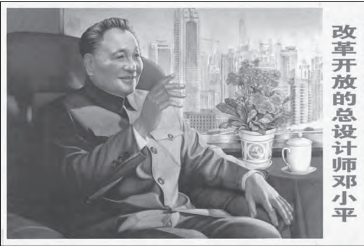
1991 poster of Deng Xiaoping, “the general architect of reform and opening up.”

improve overall production, the government first had to provide enough food for the country. The government began by loosening state controls and providing farmers with more autonomy. Successful reforms in agriculture encouraged state planners to transplant techniques learned from agricultural reform to industry and to conduct further experimentation. The primary development that drew from the field of agriculture was to allow industrial producers to sell surpluses in addition to the amount already sold to the government under procurement agreements. As part of an overall reduction of state intervention in various industries, the state also began decentralizing planning from the central government in Beijing to local and provincial governments, on the basis that cadres on the ground would have a clearer picture of what and how much could be produced. Experimentation of this sort was part and parcel of how party functionaries across China were able to develop reforms that suited particular circumstances, though many of these were often unsuccessful. Yet, through successive experimentation and learning from other examples, the state gradually learned new and better techniques to implement across a wide spectrum of areas.