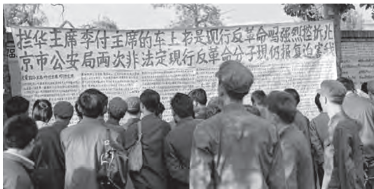
In 1978, some Beijing citizens posted a large-character poster on the Xidan Democracy Wall to promote the fifth modernization political democratization.

resonated more strongly with the party than Hua's rigid dedication to Mao. By 1978, Deng outmanoeuvred Hua by harnessing popular sentiment as expressed in the Democracy Wall Movement (1978–1979), creating alliances with reformers and bringing survivors of the Cultural Revolution back into the fold, cementing his place as undisputed paramount leader of China. Now in charge, Deng had a massive task at hand. Following the chaos of the Cultural Revolution, the country was going backward rather than forward. The search for a modern China continued in earnest as Deng