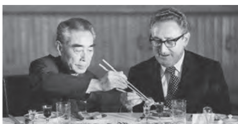
Premier Zhou Enlai (Left) with Henry Kissinger in Beijing, China, July 1971.

To go along with reopening China to the global economy, Deng presided over a major overhaul of China’s foreign relations. 13 Building on Zhou Enlai and Henry Kissinger’s engineering of rapprochement in 1972, Deng negotiated the establishment of full formal diplomatic relations between the People’s Republic of China and the United States in 1979. The normalization of Sino–American relations was a stunning coup, as the US promised to break off formal relations with the Republic of China