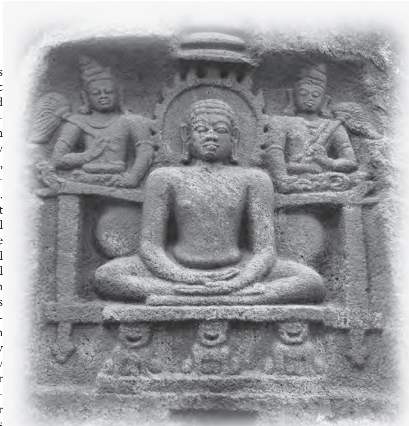
Rock carved Mahavira sculpture, Thirakoil, India.

In many ways, Jainism is a child of India. It agrees with a number of other Indian traditions in accepting the idea that embodied living beings have been trapped in the cycle of births, lives, deaths, and rebirths since beginningless times. This means that our current lives have been preceded by an infinite number of births in numerous possible life-forms, which for Jainism extend from heavenly, human, and infernal beings to animals, plants, earth-, water-, fire-, and air-bodied beings. Unlike Buddhism, Jainism accepts the existence of jivas , that is, souls or conscious immaterial