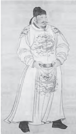
Portrait of Emperor Taizong.

Zhao. Wu Shihuo—though originally a lumber merchant—was a gifted military strategist and a follower of Tang founder Li in his rebellion against the Sui regime. When the Tang Empire was founded, Li appointed Wu Shihuo President of the Board of Works, a high-ranking post he held for several years. Li later promoted him to governor-general of two important prefectures. The Li-Wu close friendship is also evident in Li's selecting a second wife for Wu from the Sui royal family, a collateral line of the Yang. Wu Zhao was born of this union in 624.