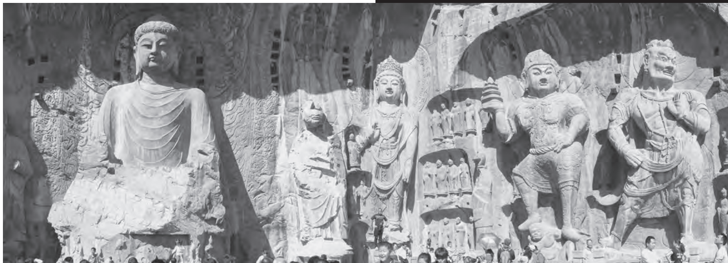
Li Zhi cave at the Longmen Grottoes near Luoyang in Henan Province, China is the ancestor-worshipping cave, and the largest of all caves carved on the west hill. It was built between 672 and 676 for Empress Wu Zhao. It features a large Vairocana Buddha.

After she gained power, Wu Zhao helped spread and consolidate Buddhism and supported the religion by erecting temples so priests could explain Buddhist texts.