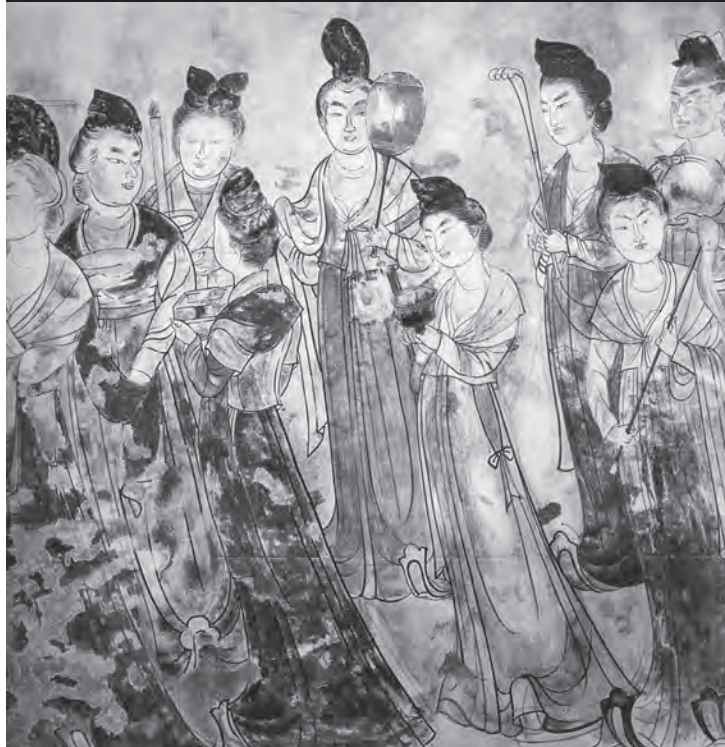
Tang court ladies from the tomb of Princess Yongtai (granddaughter of Wu Zhao) in the Qianling Mausoleum, near Xi’an in Shaanxi, China.

Wu pleased the empress and Imperial court servants through the strategy of winning their trust by her friendliness and generosity. Court attendants were willing to report to her even the most trivial court occurrences.