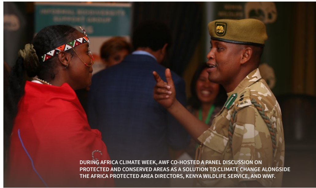
DURING AFRICA CLIMATE WEEK, AWF CO-HOSTED A PANEL DISCUSSION ON PROTECTED AND CONSERVED AREAS AS A SOLUTION TO CLIMATE CHANGE ALONGSIDE THE AFRICA PROTECTED AREA DIRECTORS, KENYA WILDLIFE SERVICE, AND WWF.

The second thing that is important from AWF's perspective is the outsized role of Africa in addressing both crises. Neither