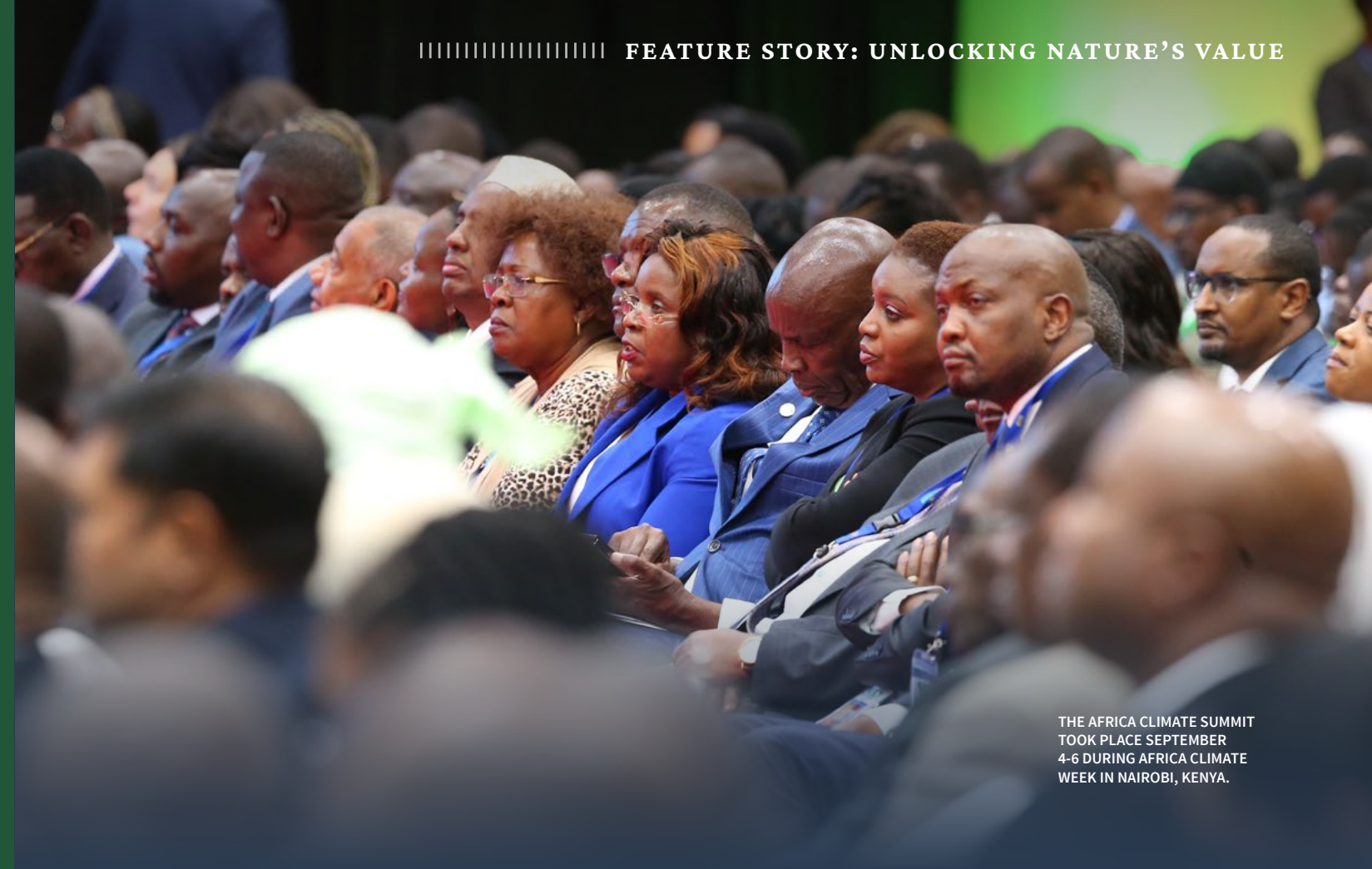
THE AFRICA CLIMATE SUMMIT TOOK PLACE SEPTEMBER 4-6 DURING AFRICA CLIMATE WEEK IN NAIROBI, KENYA.