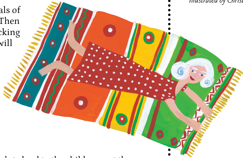
Illustration © Christopher Corr from My Granny Went to Market