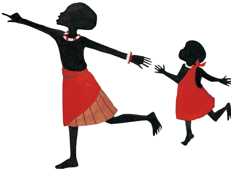
Illustration © Julia Cairns from We All Went on Safari