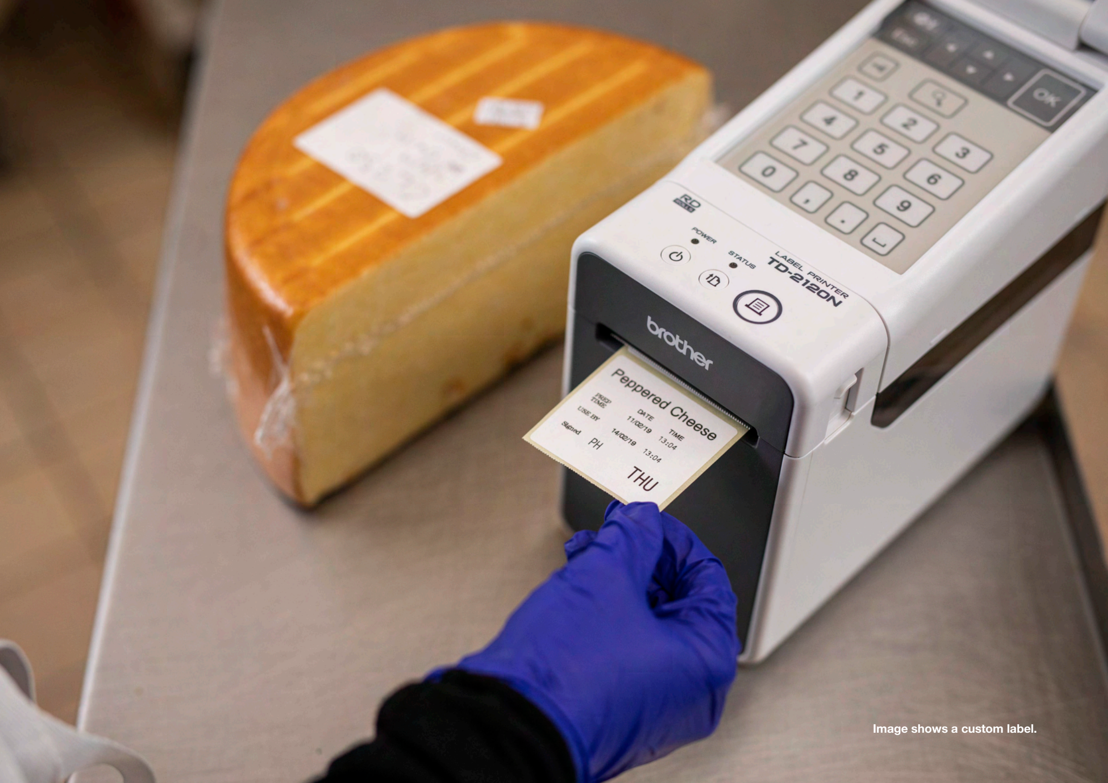
Image shows a custom label.