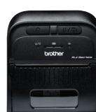
RJ Lite 3000