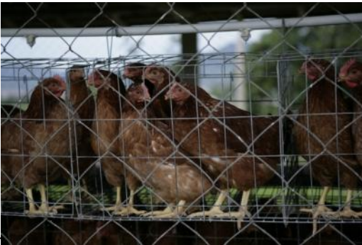
A barren battery cage in Brazil. This system is now banned in the EU. The birds are unable to flap their wings or perform most of their other natural behaviours.

Cages are typically metal wire and approximately 50cm x 50cm in size with a trough for feed, nipple drinkers and a sloped wire floor so the laid eggs can roll out. There is no nest space, perch or litter to scratch and dust bath but do often have a claw shortening device. The arrangement of cages ranges from single tiered to vertically arranged stacks of up to 9 tiers high. Inspection of birds in higher tiers can be difficult. The cages are indoors in huge sheds with a controlled environment and no daylight. The number of birds in one shed can vary from hundreds to hundreds of thousands. Farms may have over a million hens but in a number of sheds.