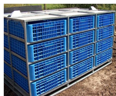
These crates are used to transport birds to their next destination.

Laying hens are transported more often in their lifetime than for example meat chickens: they are moved from the hatchery to the growing site (as 'day-old chicks') and then on to the production farm for laying (except some organic birds that are reared and lay on the same site). At the end of lay, the birds are transported to a slaughterhouse 7 . When moving from the hatchery at a day old it is crucial that there is minimal stress and the correct environment is maintained. The transport conditions for chicks are believed to influence the bird's health and growth rates for the rest of her life 8 .