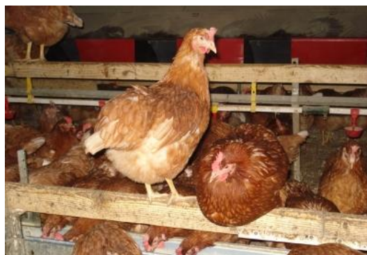
A single tier system gives birds the opportunity to perch. Hens are stocked at up to 9 birds/m 2 in the EU.

Single-tier (barn systems/percheries): Typically only have one single tier (it varies as to the addition of aerial perches), part-litter, part raised perforated floor with the perches incorporated. Nest boxes, nipple drinkers and feeding troughs are all provided. This system is stocked at up to 9 birds/m 2 .