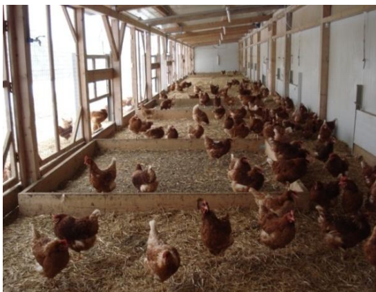
A wintergarden is a run area attached to a barn that allows birds additional space to dust-bath in litter and experience natural light.

Wintergarden: This is a littered, covered area additional to the main shed. Popholes allow birds access to the wintergarden from the shed. It is covered with wire netting, so is airy and naturally lit. Sometimes this area is called a verandah. By providing wintergardens at an early age, birds are encouraged to range later on in life when they are housed in free-range systems. The wintergarden area is not normally included in the calculation of the official floor space available to the hens as they do not have access to it at night.