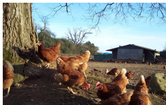
Free-range systems give access to pasture and allow birds to exhibit all their natural behaviours. Trees help encourage birds to range.

Hens in free range systems are given access to an outside range. The housing provided is either a fixed shed or a mobile house that can be moved around the pasture. The buildings are the same inside as barn/aviary systems. Popholes allow access to the range. At night the hens come inside for protection from predators and to ensure eggs are laid in the nest boxes. The pasture area outside requires shelter to encourage birds to range further. Laying hens use a range more if it is of good quality (e.g. with presence of cover in the form of trees, bushes or hedges or with artificial shelters 11 ). Natural cover such as trees can also help reduce levels of injurious feather pecking 12 .