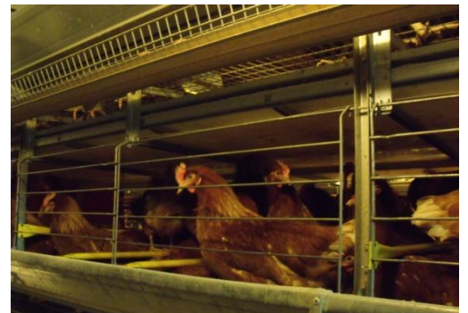
A colony cage is an enriched cage that houses 60 – 80 birds, with furnishings including a perch, nest box and litter area.

Enriched cages (also sometimes called modified cages) are similar to conventional battery cages but provide more space and height, a nest box area, at least 15cm of perching space per hen, a small area of litter and a claw shortening device. They come in a range of sizes. Smaller ones may house fewer than 10 birds (the only type allowed in Sweden). The larger and more widely used versions house 60 - 80 birds and are called colony cages. The birds have an area of 750cm 2 per hen. From January 2012 this became the only cage system allowed for laying hens in the EU. Outside the EU enriched cages are uncommon. A discussion has now started in the USA about banning battery cages.