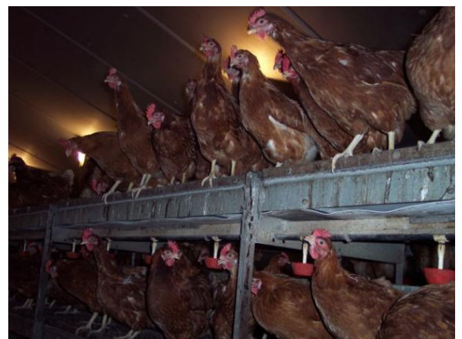
Multiple tiers allow hens to choose different levels to perform their natural behaviours and escape other birds more easily.

Nest boxes along with feed troughs and nipple drinkers are provided on several tiers. Other housing systems may have aerial perches, which can be an A-frame, a pole or other resting place raised above the ground. The maximum stocking density is 9 birds/m 2 .