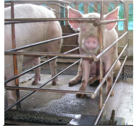
Sow stall – used for pregnant sows throughout their gestation period. A few days before they are due to give birth, they are moved to a farrowing crate.

At breeding time, dry sows and gilts are introduced into a small pen that contains a single boar, who then mates with them ('serving'). This may be repeated if they do not become pregnant. Pigs are examined with ultrasound to confirm pregnancy, about one month after mating. Artificial insemination (AI) can also be used whereby boar semen is introduced manually into the sow by the stockperson (caretakers). Once mated, both gilts and dry sows are kept in either 'sow stalls' or 'tether stalls' (see below) during their pregnancy which lasts for about 114 days (3 months, 3 weeks and 3 days). Stalls are used to maximise the number of animals that can be housed in a given area. Stalls also prevent the sows from fighting each other and make it easier to manage the sows (e.g. provide veterinary treatment) with fewer stockmen.