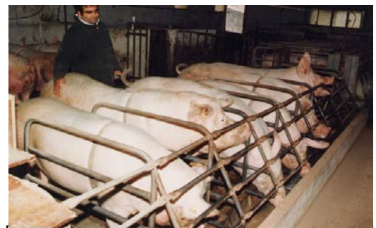
Tether stalls where sows are kept during their pregnancy, and tethered with a chain or strap

be reduced during late pregnancy to reduce the risk of obesity. This can lead to hunger.