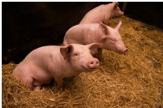
Weaners in enriched indoor systems are housed in pens with solid floors and bedding, allowing them to perform more natural behaviours like foraging and exploring.

In most alternative systems, weaners are kept in indoor pens. This is because they are less able to cope with environmental (weather) extremes. Even in organic farming, weaners are generally kept indoors. Pens usually have deep bedding. In different parts of the world, different substrates have successfully been used as bedding including straw, wood shaving, rice hulls and peanut straw.