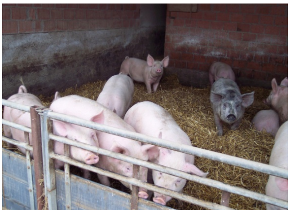
Pigs in higher welfare systems have more space and enrichment, such as straw bedding.

Rearing pigs are kept in a variety of different husbandry systems. Most rearing pigs tend to be kept indoors. This is because if they are kept outdoors on pasture, they will root it all up. Paddocks are soon turned into giant mud baths. In some countries, the pig's ability to clear the land has been put to good use. Farmers in the UK and Sweden have used pigs to 'plough' the land after harvest and also clear woodland after it has been felled.