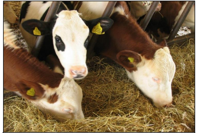
In the EU, calves must be group housed after 8 weeks old because social contact is important for their welfare.

- Following weaning, calves can be vaccinated against certain bacterial or viral diseases and be given treatment for parasites. Vaccination usually requires a course of injections.