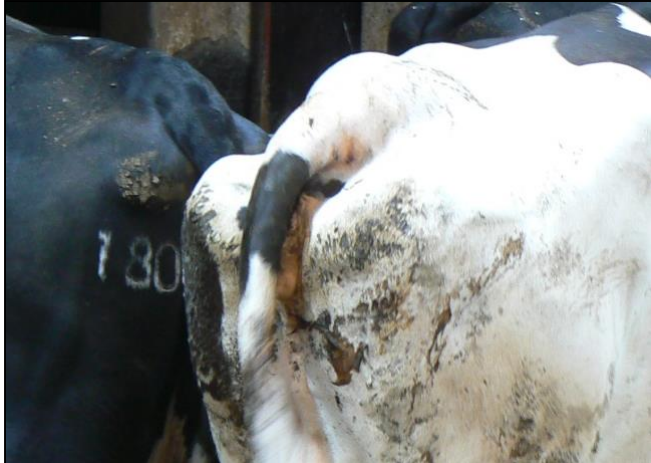
Docking of tails in the EU is illegal but is still practised in some member states and in other countries around the world.

- Tail docking: Some farmers dock the tails of calves at about 10 days old based on the disproven belief that it is more hygienic for the cow, and for the farmer during milking. This is done either by hot iron, crushing or tying a rubber band around the tail which stops the blood flow so it eventually falls off.