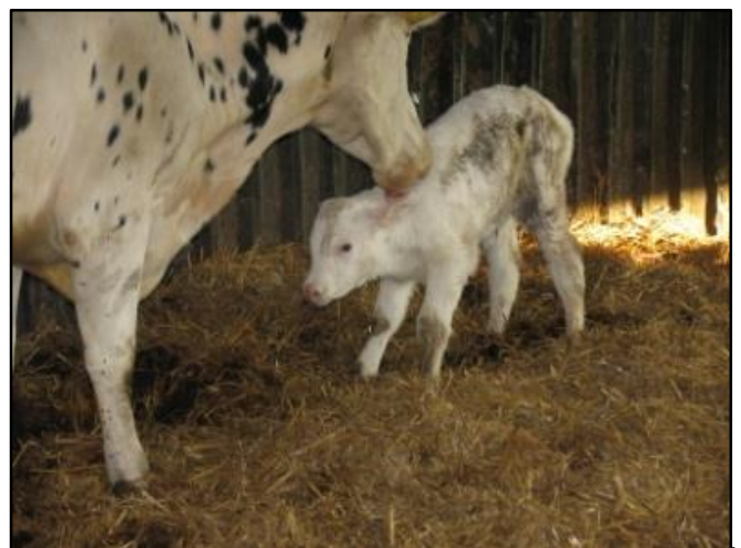
Cows typically give birth for the first time at about 2 – 3 years old. Calves are able to stand almost immediately after being born.