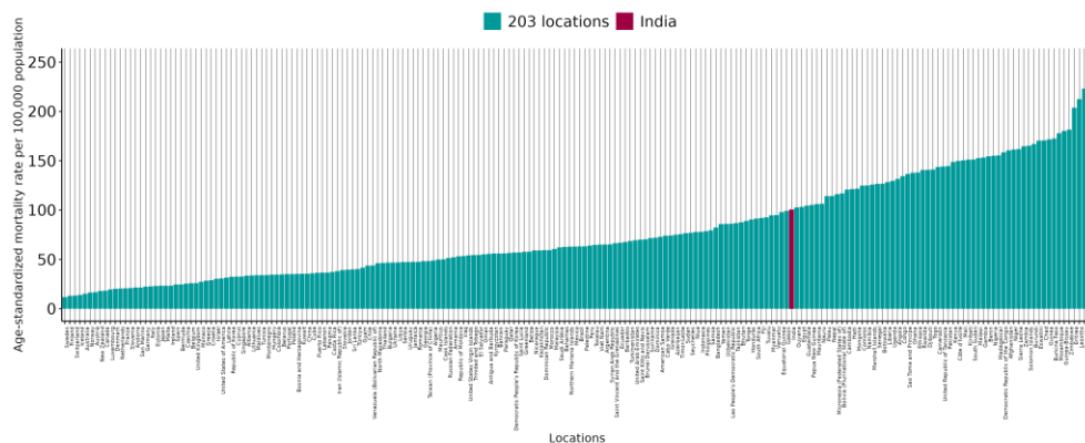
The length of each bar states the age-standardized mortality rate per 100,000 population associated with AMR in 2019.