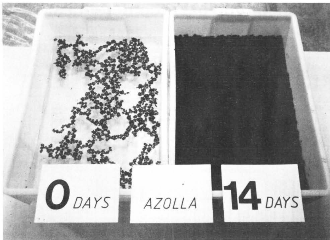
Figure 3. The rapid growth of which Azolla is capable is shown by the plants in these two trays: those on the right are two weeks older.

plant with nitrogen. This symbiosis is capable of very rapid growth in media which do not contain chemically-combined nitrogen (Fig.3). Under good conditions, 30 kg N/ha can be fixed in two weeks. Although the potential of the Azolla symbiosis has only recently gained international attention, it has been used for centuries in southern China and Vietnam as a source of nitrogen for flooded rice. Since the fixed nitrogen is assimilated into the fern biomass it is not directly available to the rice plant. The Azolla plants must be incorporated into the soil and allowed to decay before the nitrogen becomes available for rice growth. A new co-ordinated research programme will use ^{15}\text{N} isotopic techniques to quantify the amount of nitrogen fixed by the Azolla symbiosis under realistic field conditions,