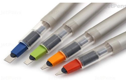
Set of Calligraphy pen