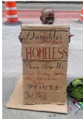
Message for the passers by

You can also use the power of calligraphy for creative and personal uses. Through beautiful calligraphy, you can draw attention of viewers for your messages. Definitely shows the power of calligraphy to go beyond like graffiti writing.