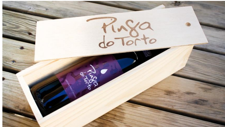
Calligraphy on the box & bottle of limited edition perfume

Because calligraphy is done by hand, it expresses emotion very well. Used in a brand mark or in advertising, good calligraphy can give the user something that technology can't provide: the human touch. But it will always be available in limited edition.