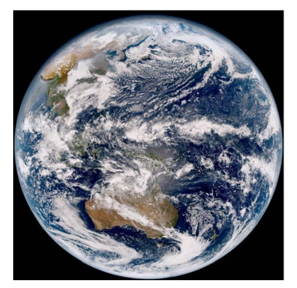
Figure: First Image by Himawari-9 at 02:40 UTC on 24 January 2017

http://www.jma-net.go.jp/msc/en/support/ https://www.wmo-sat.info/satellite-user-readin ess/topic/satellites/himawari-8/