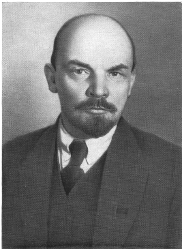
V. I. LENIN 1920