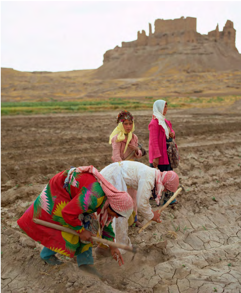
Lean years: Between 2007 and 2010, Syria suffered a drought that made farmers' lives extremely difficult. Some one million of them eventually gave up their businesses and moved to the cities.

certain amount of means that particularly the poorest of the poor lack. They will stay behind.