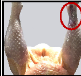
Fail (drumstick with bruise > quarter size)