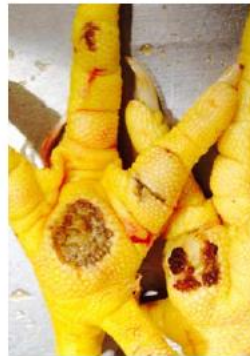
Fail (washed paws) Ulceration is present and lesion is more than 1/2 the area of the foot pad; lesions are also present on the toes