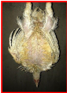
Pass (normal wing posture with wings tucked close to body)