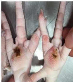
Pass (washed, post-scald paws with scab covering less than 1/2 the area of the foot pad)