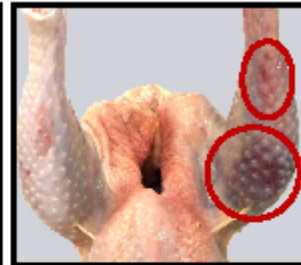
Fail (drumstick with various bruises covering > quarter size)

Note: If both legs are injured on one bird, this counts as one 'leg injury failure' for auditing purposes.