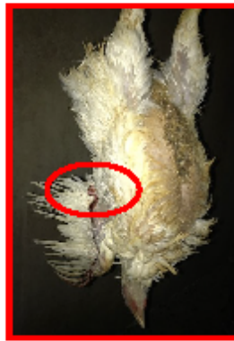
Fail (broken or dislocated bone is visible (circle); abnormal wing posture)