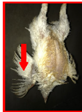
Fail (wing posture is not normal and wing hangs straight down (arrow) due to dislocation )

Note: Posture of the wings is the primary criteria for this portion of the audit . Birds with normal wing posture will have their wings tucked close to the body or may have wings slightly extended from the side of the breast. Both wing appearance and wing position should be evaluated for accuracy during the audit to determine if any broken or dislocated wings are present in the 500 bird sample being observed. Since wing damage can occur post-mortem due to wing contact with feather removal equipment, evaluate wings prior to feather removal for audit accuracy.