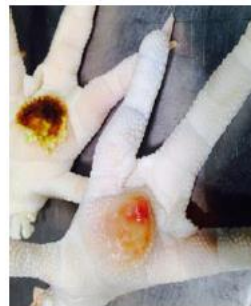
Fail (paws without cuticle) Ulceration is present and the lesion is more than 1/2 the area of the foot pad. Swelling of the foot pad is also visible.