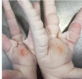
Pass (paws with no cuticle and normal skin color)