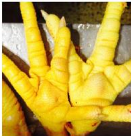
Pass (washed paws with no lesions & normal skin color)