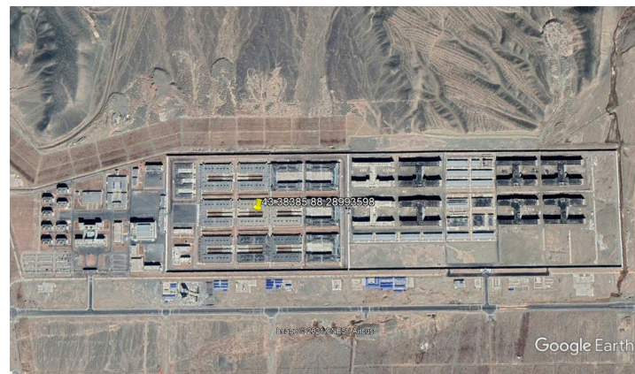
19 March 2020 (image available on Google Earth)

64. OHCHR examined a cross-sample of available judicial decisions in cases alleging terrorism or “extremism” with respect to defendants from ethnic communities in XUAR in the period 2014-2019. The number of publicly available and relevant court decisions is limited and may not necessarily be representative of the totality of judicial practice, but those that are available provide important insights into the way the judiciary has interpreted acts of religious “extremism”. 150 These include relatively minor infractions apparently punished severely; judgments referring to conduct being “extremist” despite none of the formal charges being related to terrorism or “extremism”; courts labelling acts as “extremist” without explaining how they fulfilled the applicable legal definition(s); the apparent targeting of underlying religious behaviour rather than the actual act for which the person is being prosecuted; and indications of an approach that considers any type of violation of law committed by a Muslim person as presumptively “extremist”.