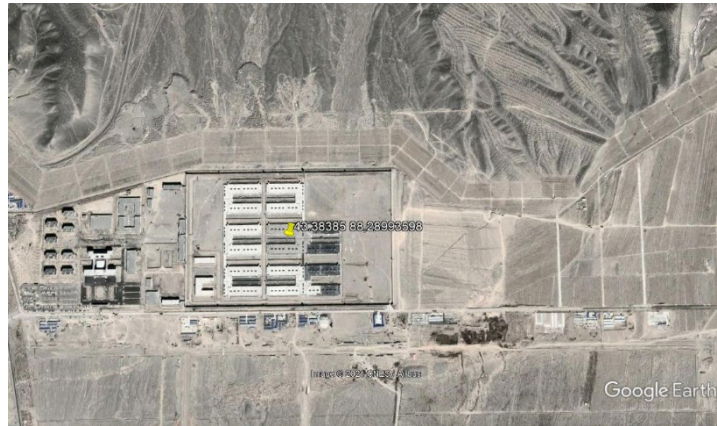
22 April 2018 (image available on Google Earth)