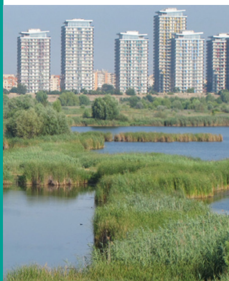
Wetlands Extent Index