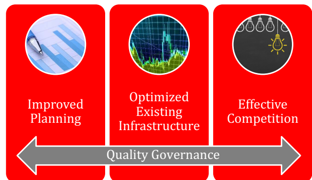
FIGURE 1: TRANSMISSION REFORM SYNERGIES