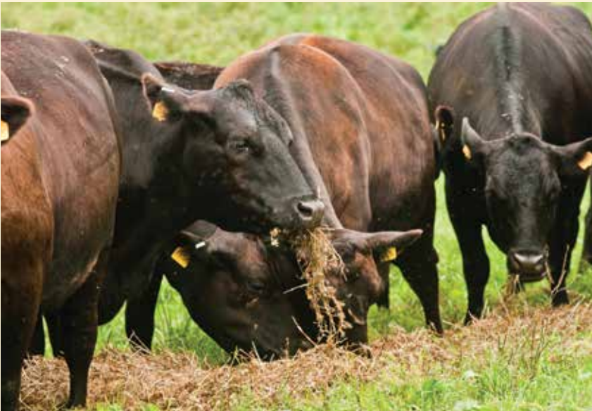
Beef cattle graze on pasture and a silage of grass and alfalfa at an organic farm in Adamstown, Md.

Organic rules require that livestock health and natural behavior be accommodated year round. One application of this rule is that livestock must have daily access to fresh air, sunlight and the outdoors, and that ruminants must have access to pasture. So if you're already providing outdoor access and grazing your ruminant livestock, the transition to organic will be less complicated than if you operate a confinement system. In the 1990s, many beef producers in Nebraska entered the organic market with ease because they were able to adapt existing pasture-based systems they'd perfected over the years, according to the Center for Rural Affairs. In addition, dairy farmers who use pasture as a major feed source and who are balancing milk production output with herd health practices that don't require routine use of antibiotics and hormones also find it easier to transition.