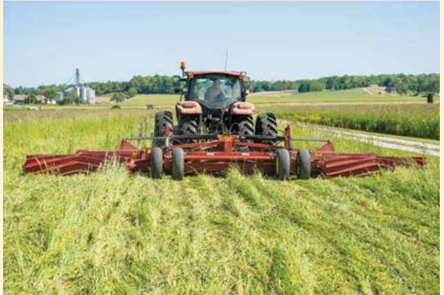
Walk-behind and tractor-mounted roller crimpers can allow you to terminate a cover crop without tillage.

In integrated crop and livestock operations, reducing tillage by rotating with perennial crops and grazing is an excellent way to build soil health.