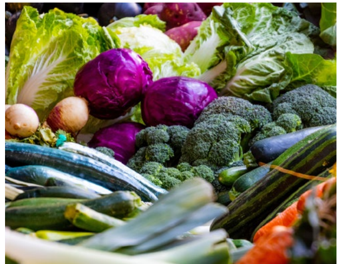
Vegetable seeds and plants available at ufseeds.com

Entisols: These soils take up much of the eastern half of the state. Entisols are