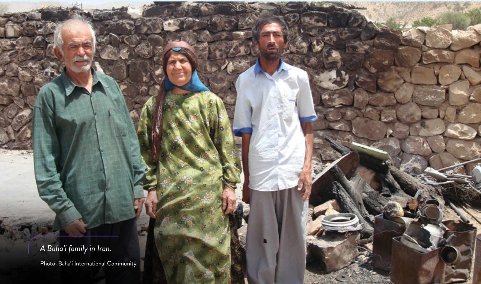
A Baha'i family in Iran.