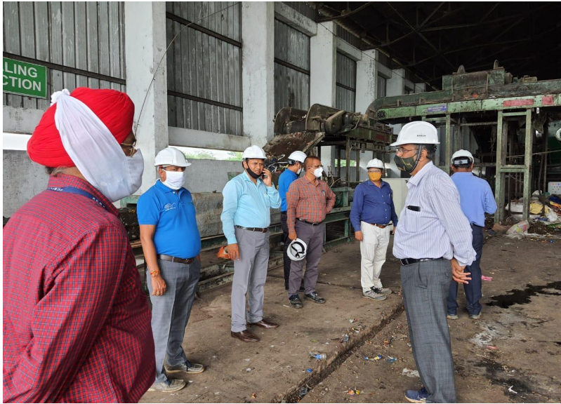
Waste to Energy Plant @ Moshi

https://timesofindia.indiatimes.com/city/pune/waste-project-to-start-in-2-months/articleshow/69909163.cms