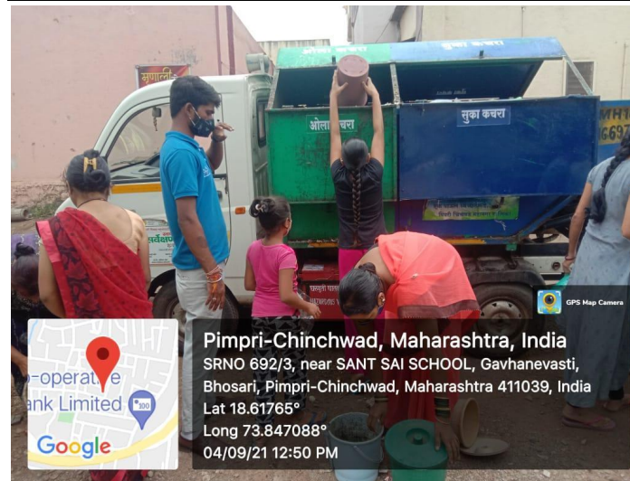
Waste collection and segregation