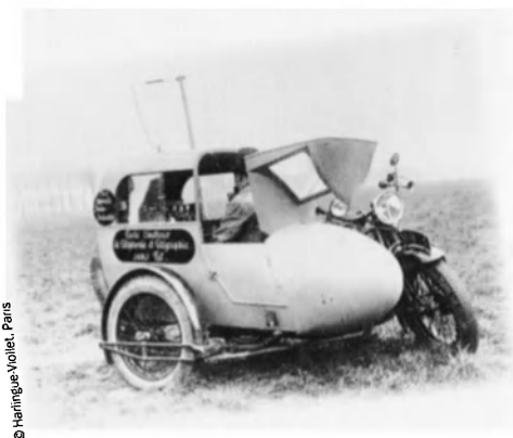
A mobile transmitter in France (c. 1935).

“Radio Code”: information is a social duty and should be in the public interest. Radio should provide entertainment, education and information that is not subject to censorship and serves objective truth.