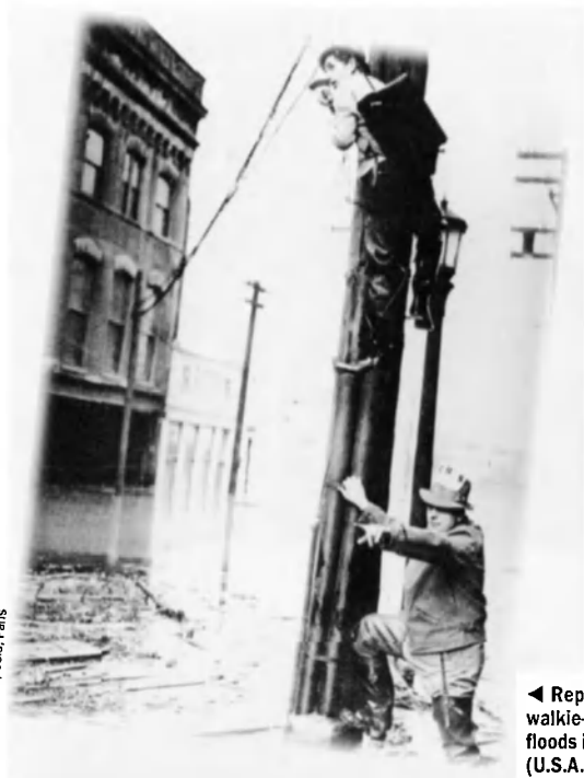
◀ Reporters use a walkie-talkie radio during floods in Louisville (U.S.A.) in 1927.