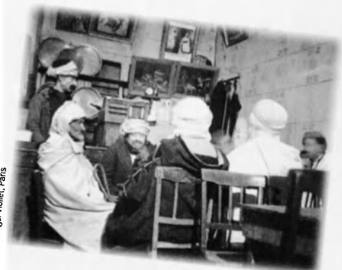
◀ Algerians listen to the radio in a café (1939).