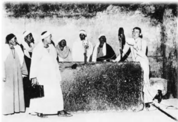
▲ British archaeologist Walter Emery broadcasts to America from the burial chamber of the great pyramid of Cheops (Egypt, 1930).

► 23 February: In the U.S.A. the Radio Act grants radio protection under the First Amendment to the Constitution (on free speech) and sets up the Federal Radio Commission (FRC). From now on a licence is required in order to broadcast.