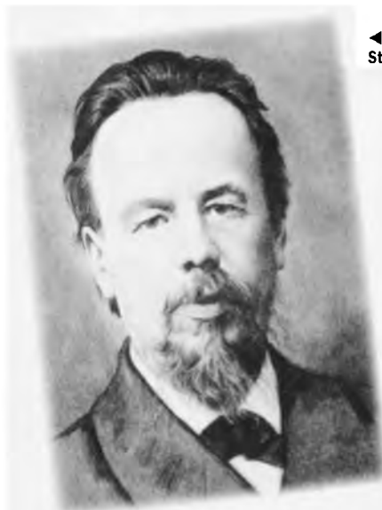
◀ The Russian engineer Aleksandr Stepanovich Popov (1859-1906).

► 12 December: Marconi makes the first transatlantic wireless transmission, using Morse code, between Poldhu in Cornwall (U.K.) and St. John's, Newfoundland.