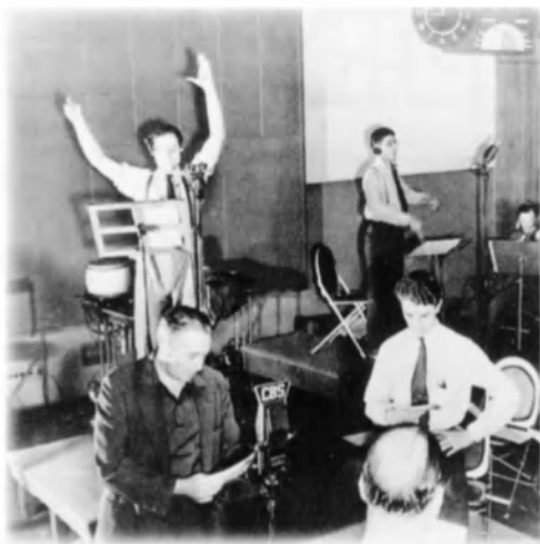
◀ Arms upraised, Orson Welles directs a rehearsal of a radio programme in 1938. His broadcast on 30 October of an adaptation of H.G. Wells's War of the Worlds sowed panic among listeners who thought the country was being invaded by Martians.