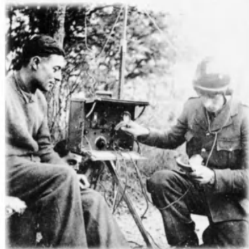
◀ Radio operators of the French Resistance (around 1943).