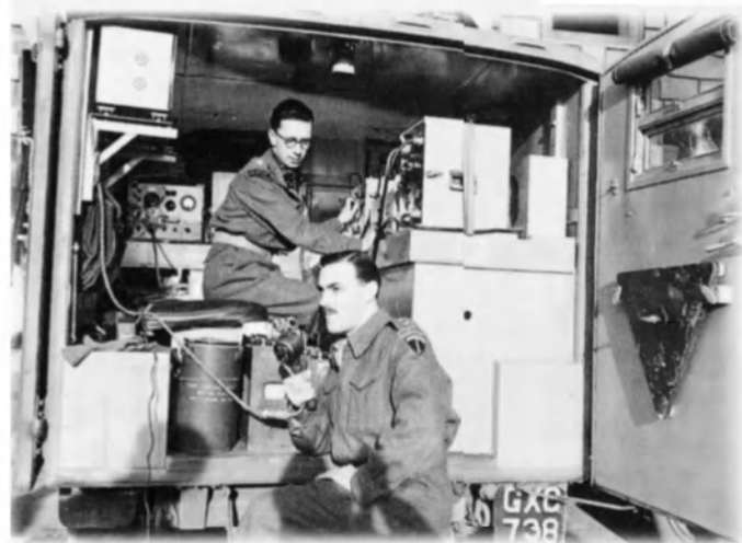
▲ A BBC mobile recording unit during the Second World War.