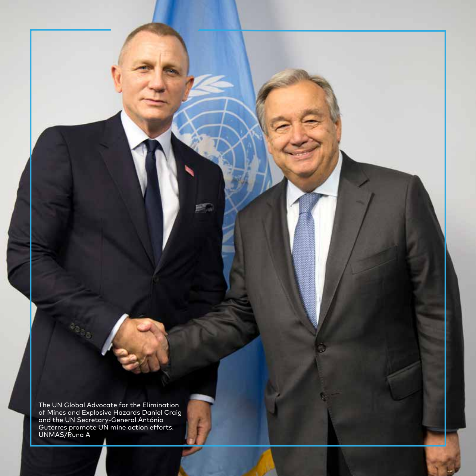
The UN Global Advocate for the Elimination of Mines and Explosive Hazards Daniel Craig and the UN Secretary-General António Guterres promote UN mine action efforts.