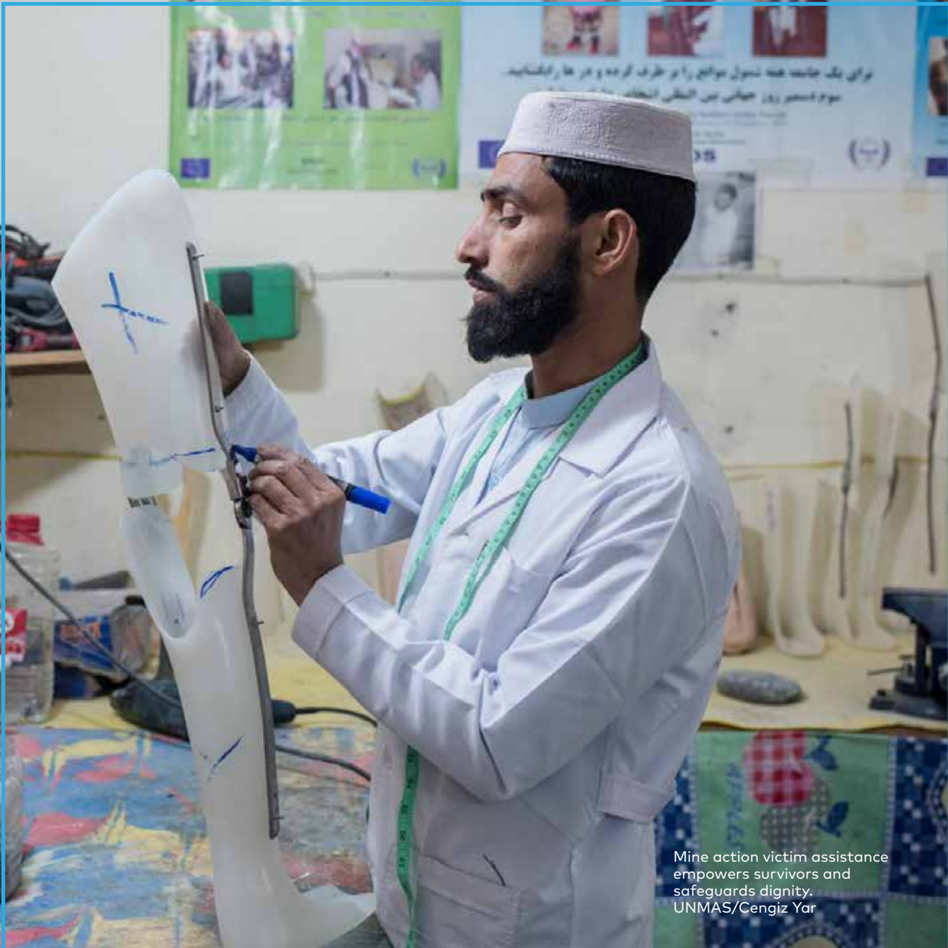
Mine action victim assistance empowers survivors and safeguards dignity.