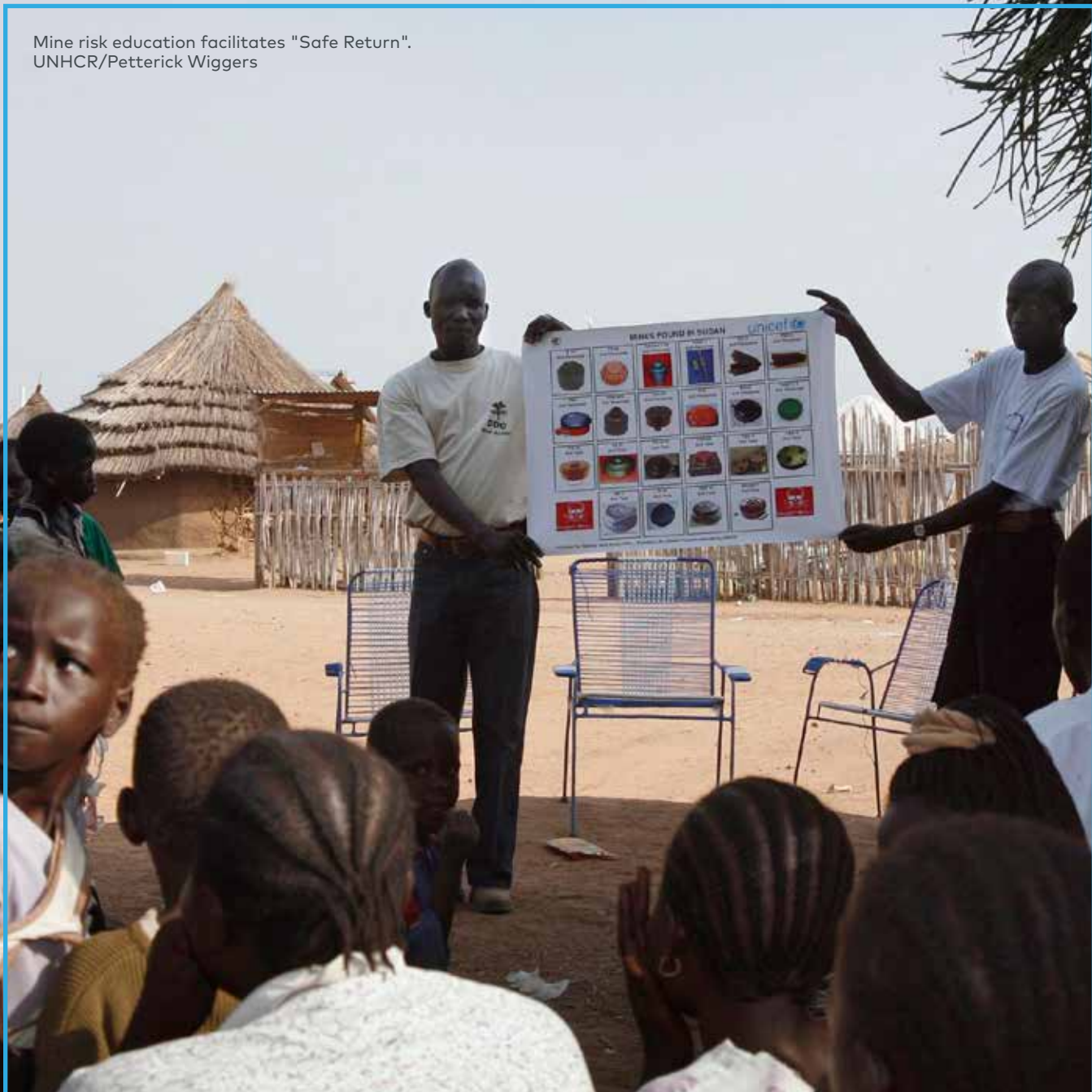
Mine risk education facilitates "Safe Return".