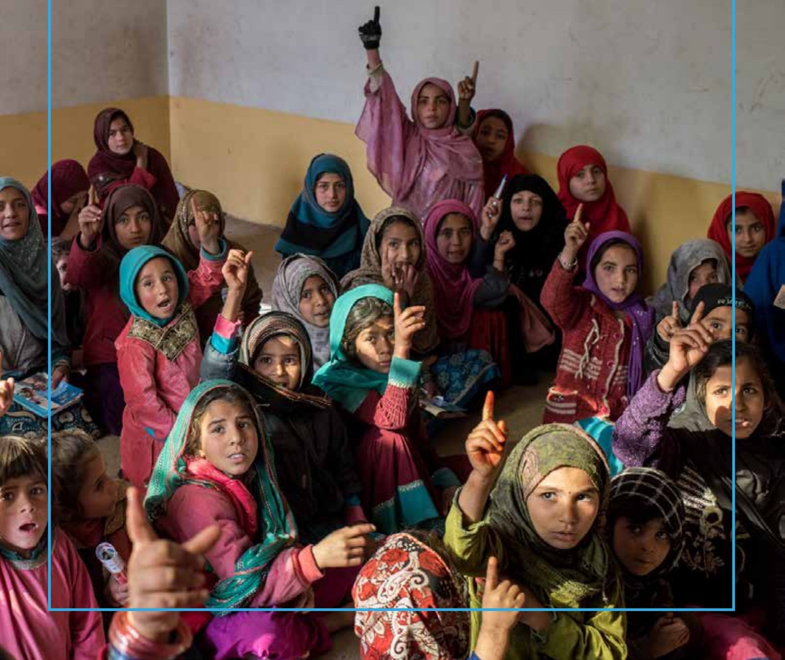
Young girls participate in a risk education session in Jalalabad, Afghanistan.