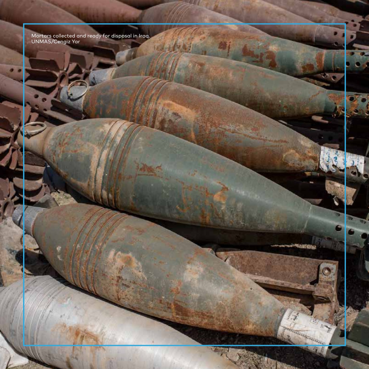
Mortars collected and ready for disposal in Iraq