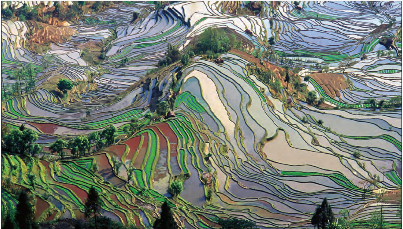
Plate 1: Rice fields in terraced hills of South China's Yunnan province: Asia's rice cultivation benefits from high nitrogen applications but it has generally low nitrogen use efficiency, often less than 30%, due to high leaching and denitrification losses.

Synthetic nitrogenous fertilisers now provide just over half of the nutrient received by the world's crops; the rest comes mostly from natural and managed (leguminous crops) biofixation, organic recycling (manures and crop residues) and atmospheric deposition. Without the use of nitrogen fertilisers we could not secure enough food for the prevailing diets of nearly 45% of the world's population, or roughly three billion people. These diets are excessive in rich countries, adequate in China, but inadequate in much of Africa. The reason for this is that about 85% of all food protein comes from cropping, whereas only 15% is derived from grazing and aquatic catches. In China synthetic fertilisers already account for more than 60% of all nitrogen inputs (Ma et al. 2010) as they do in India (Pathak et al. 2010). By 2025 more than half of the world's food production will depend on Haber-Bosch synthesis, and this share will keep rising for at least several more decades. Unfortunately, this will cause even greater nitrogen losses in the environment.