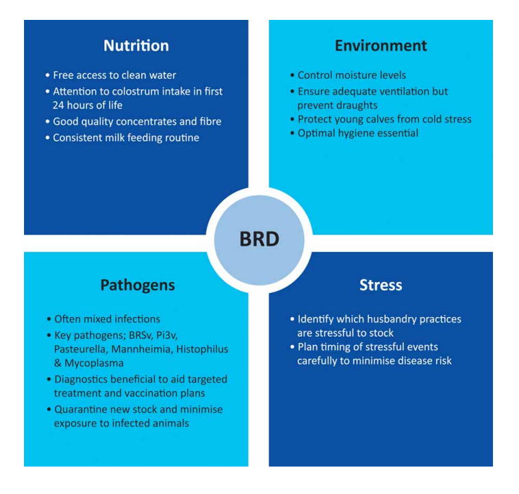
Figure 1. Risk factors for bovine respiratory disease.

Despite widespread advances in veterinary medicine, diagnostics and therapeutics, bovine respiratory disease (BRD) continues to represent a huge economic cost to both the beef and dairy sectors, with estimates of annual costs in excess of £100 million<sup>1</sup>.